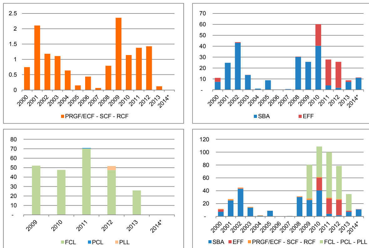
Figure 2. Commitments Under Fund Facilities (In billions of SDRs)